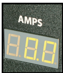
Easy to read LED meter