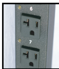
Outlet Current Metering and Control