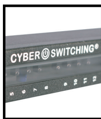
LED outlet status indicators